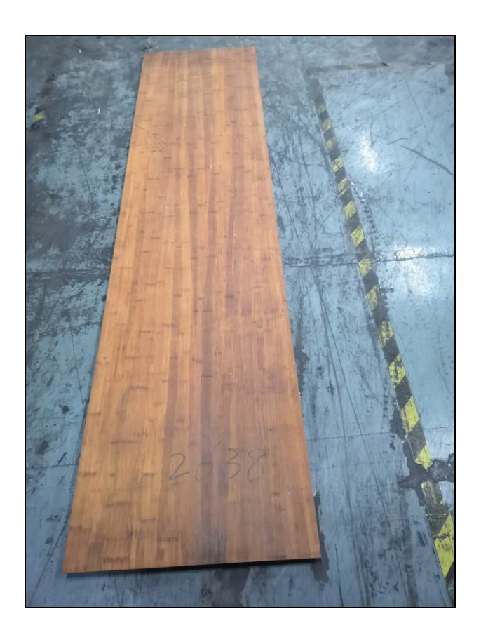
SGS authenticate the photo on original report only ***End of Report***